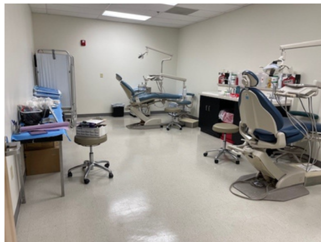
Pictured: Dental Clinic inside Ozanam Inn

The clinic also serves as an educational hub. Before patient care begins, faculty lead short workshops covering clinic operations, procedural techniques, and practical insights that extend far beyond textbooks.